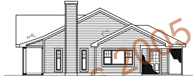
Right Side Elevation