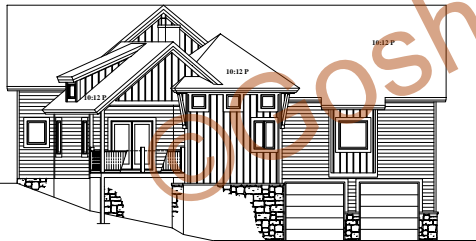
Left Side Elevation