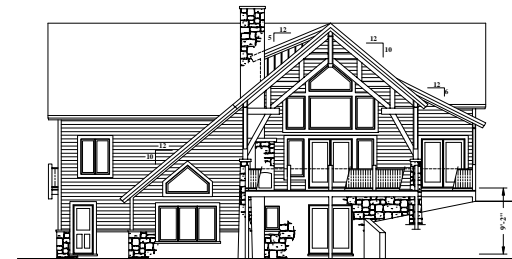
Right Side Elevation