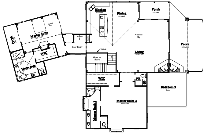
First Floor Plan 2,287 sf Living Area